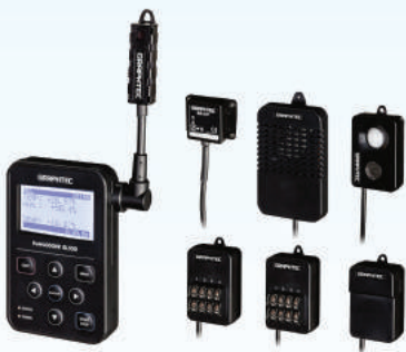
Compact Datalogger GL100

Portable and Versatile Dataloggers for General Purpose Data Acquisition