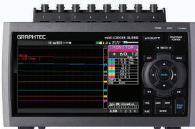
Hi-Speed/Hi-Voltage Datalogger GL980