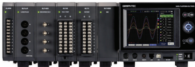
Data Acquisition Data Platform GL7000