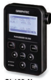
GL100-N (non-wireless unit)