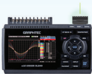
midi Logger GL240