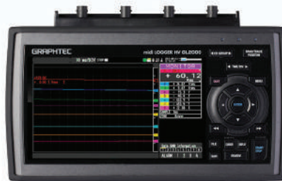
Hi-Speed/Hi-Voltage Datalogger GL2000