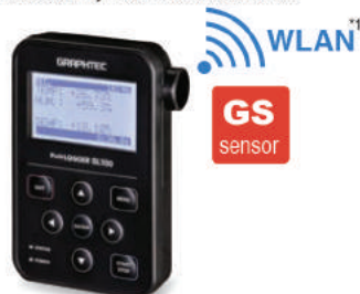
GL100-WL (with wireless LAN) *1: WLAN is available in limited regions